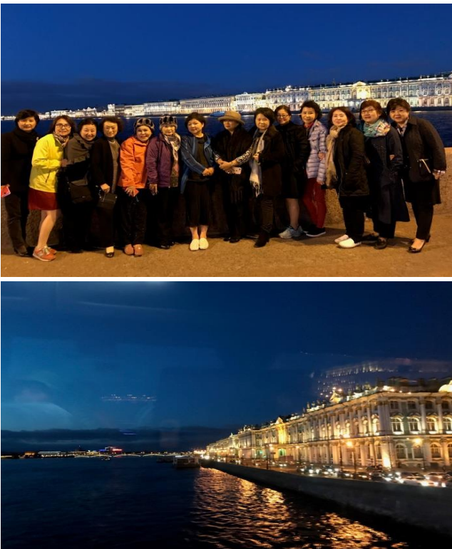
P4: St. Petersburg night view at the spit of Basil's island