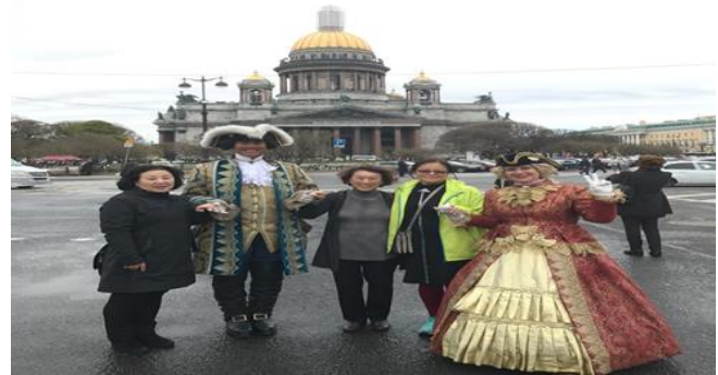
P1: Summer Palace

In St. Petersburg, we visited the beautiful Summer Palace (P1), and viewed garden fountains (P2); the State of Hermitage Museum at Winter Palace, one of the three largest museums in the world (P3); St. Petersburg Palace Square; Mariinsky Theater, a beautiful old building with over 300 years of history, and a new building with wonderful acoustics while enjoying the ballet, "The Bronze Horseman"; the Spit of Basil's island's night view (P4); Rostral column; Bronze Horseman; the Fortress of Saints Peter & Paul; Church of the Savior on the Spilled Blood (P5); Tomb of the Unknown Soldiers; Kazan Cathedral, and finally took the Sapsan Train headed to the Moscow at night.